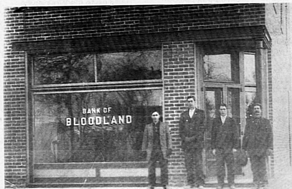
Bank of Bloodland.