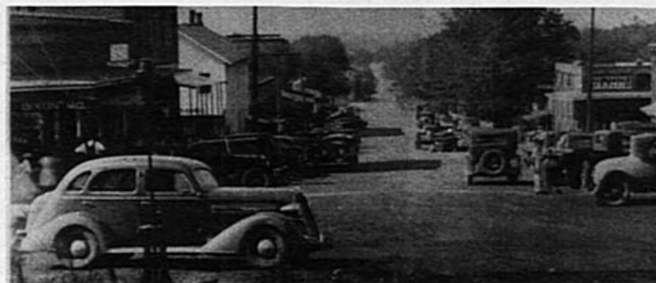
Downtown Dixon looking north from the Frisco railroad tracks.