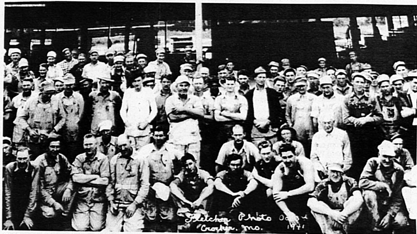
Newburg men pose for a picture along the Frisco tracks in Newburg October 3, 1941, before starting to work constructing pre-fabricated housing for Fort Leonard Wood. Sign in back of them reads, "500 defense houses for Fort Leonard Wood."

The 1939 average daily count for Route 66 just east of Route 17 (cur-