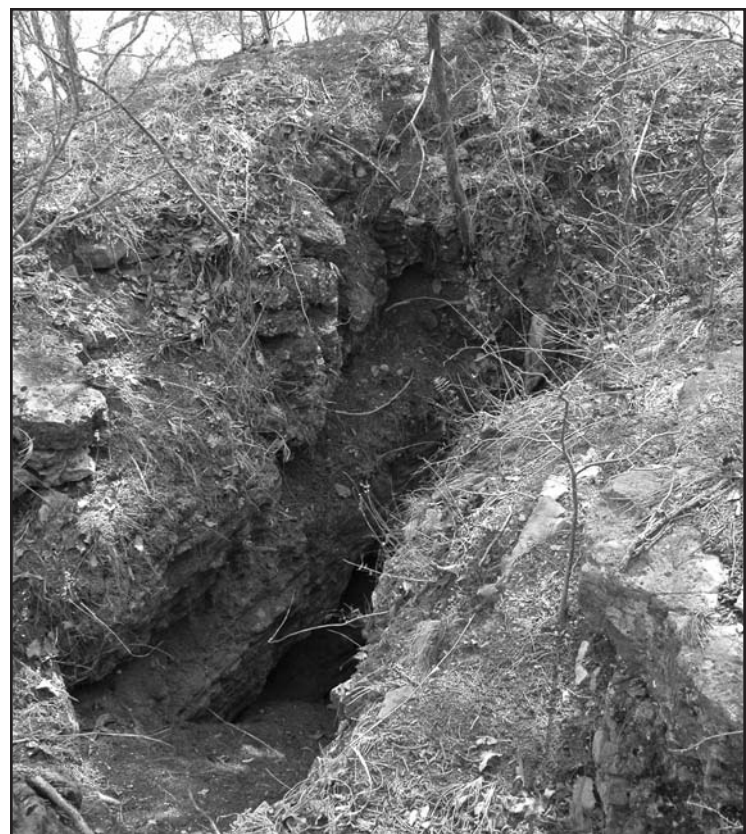
Although not in Moccasin Bend, this early digging in the southern part of Pulaski County yielded some unknown ore.

Iron, especially low grade limonite, is common throughout the Ozarks; ore-grade hematite is an exception. There is evidence of other possible hematite laden areas in the Mark Twain National Forest. The nearest iron mine working may have been in St. James at the Meramec Iron Works.