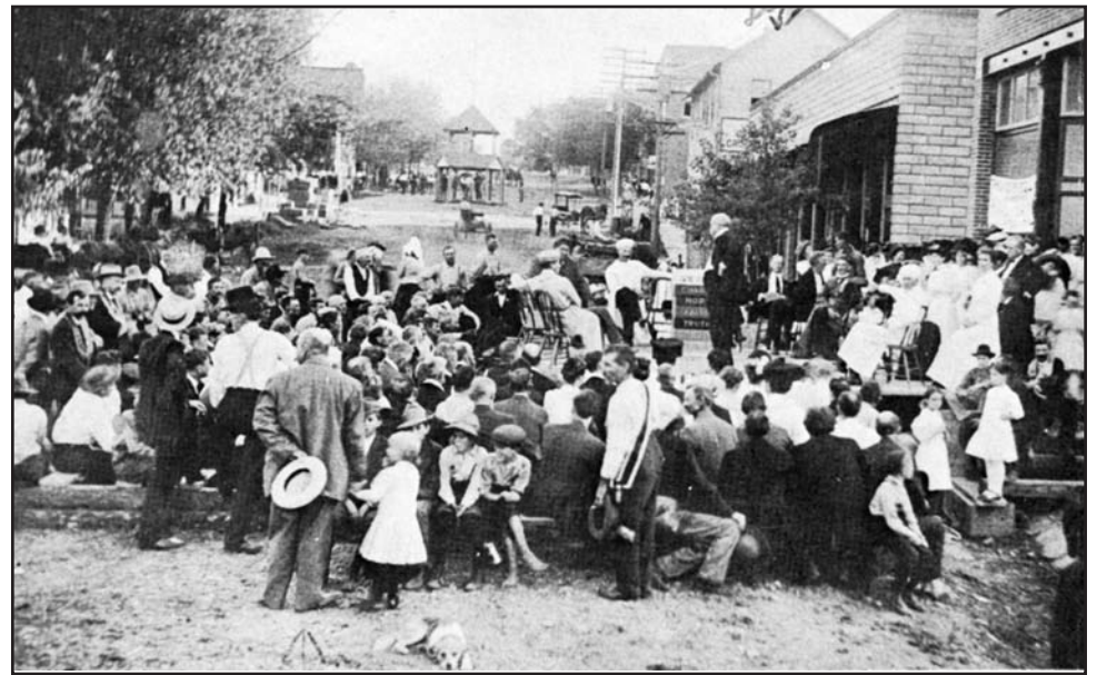
Upper left - The new fraternal hall built by the Knights of Pythias in Rolla, noted in the 1909 news feature.