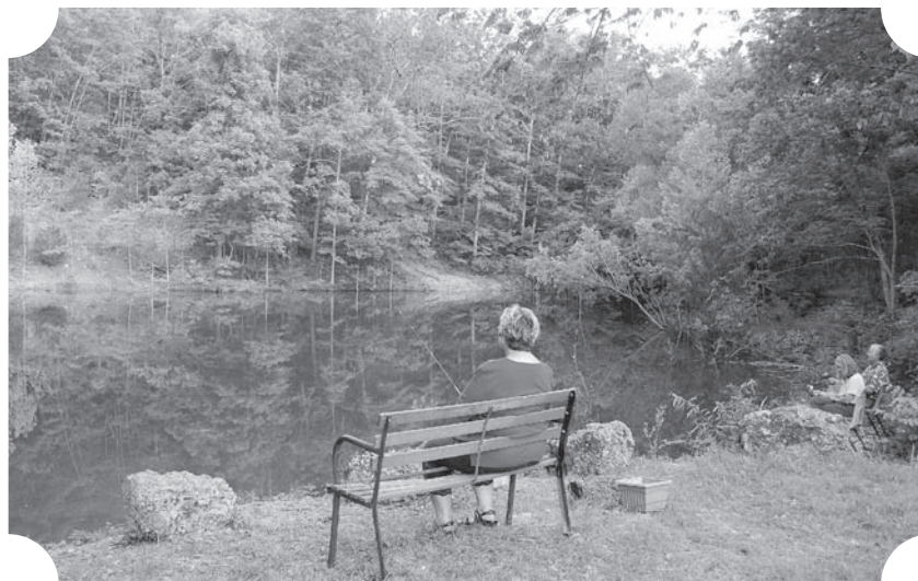
Peaceful Picturesque Hide-A-Way Lake