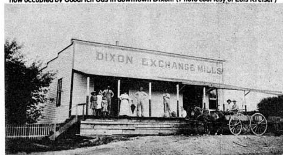
The Dixon exchange mill stood where the Dixon Locker Plant is now located. The mill ground meal for early settlers.

Get big savings during PATERSON CARPET Old Settler's Day Congoleum Sale.