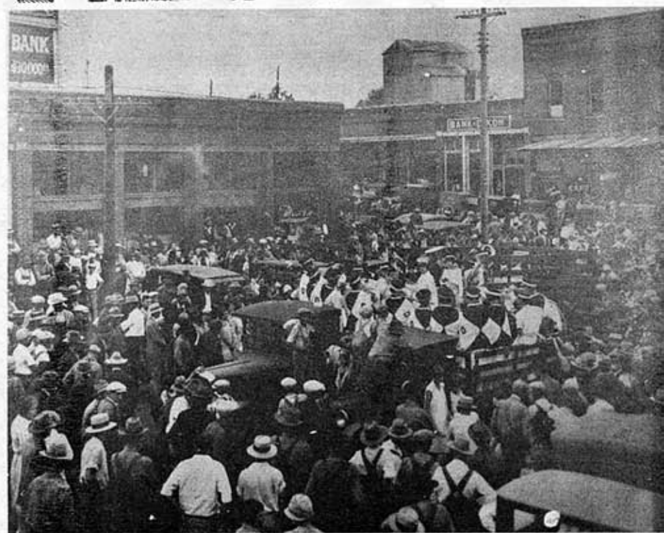
Dixon in the horse and buggy days before the streets were paved.