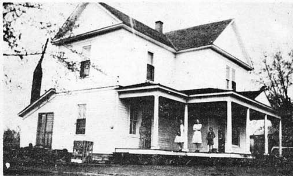
This was the 1st house ever built in Dixon. Originally made of logs, it was added on to over the years.