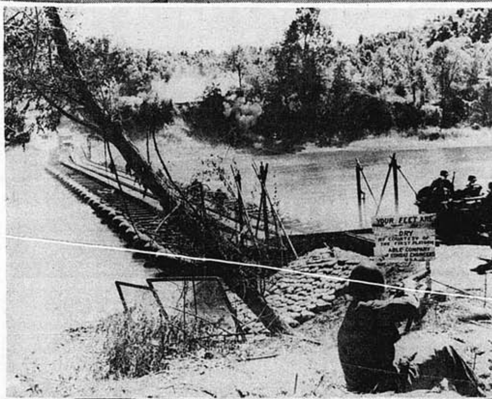
During filming of the battle scene.