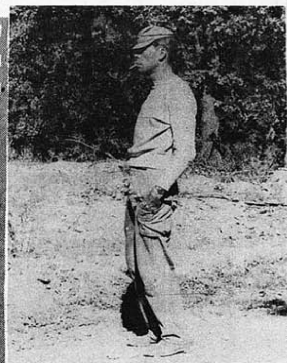
Actor Lee Marvin giving his impression of a soldier.

Korea, according to the storyline. The film was originally made under the title, "BAPTISM OF FIRE," but was changed upon completion.