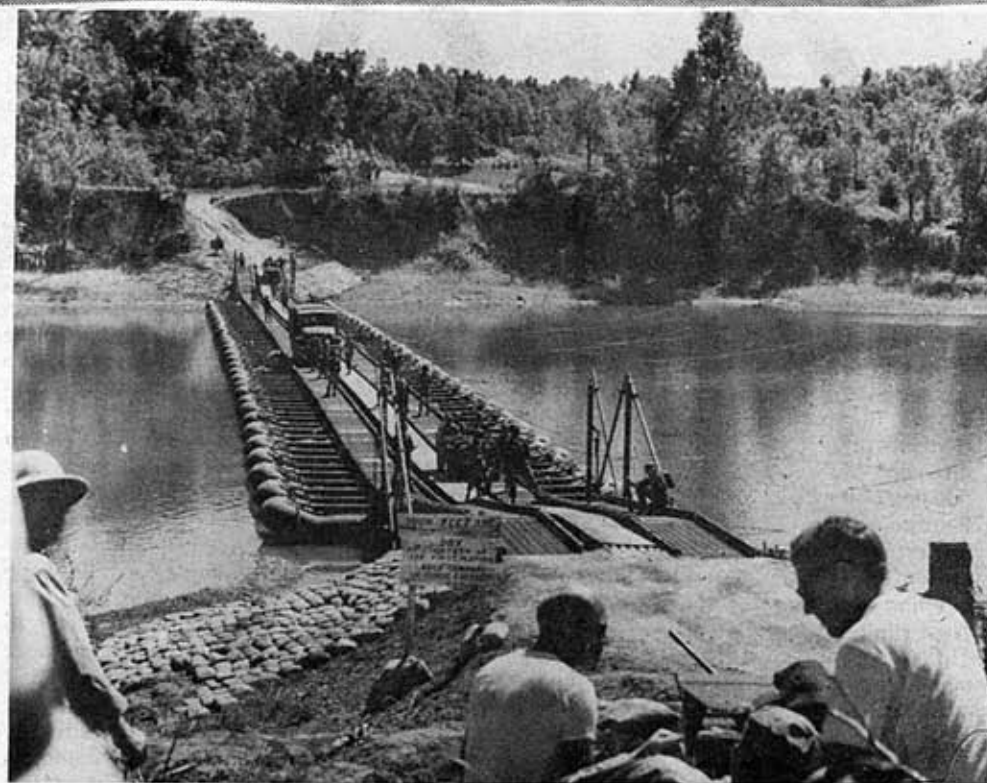
Camera and crew.