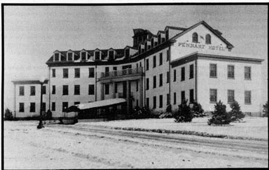
The Pennant Hotel later became the Manor Inn. In the early 60's the top floor was taken off and a dining room was added. The building was recently torn down and a new motel built on the spot. This picture dates to sometime in the 1930's.