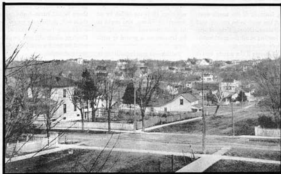
Overlooking Rolla, Missouri from the Phelps County Courthouse around 1908.