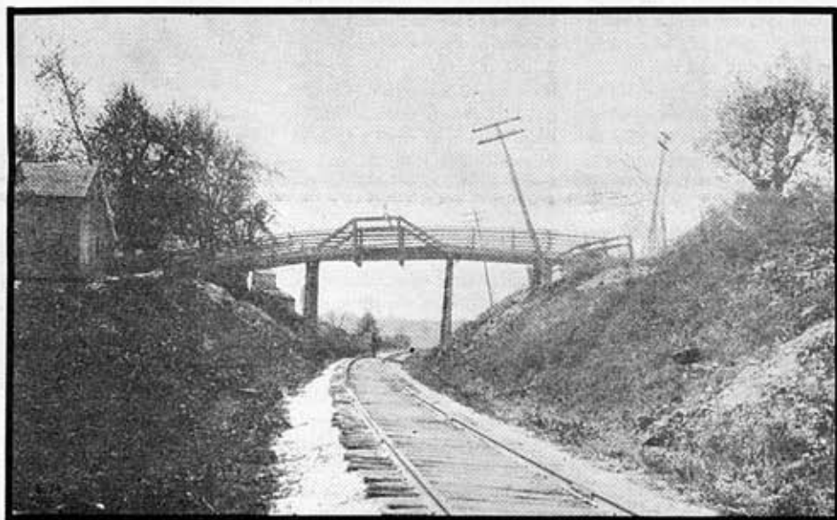
This 1912 photo of the Main Street Bridge in Rolla, Missouri shows the scene hasn't changed much in the past 78 years.