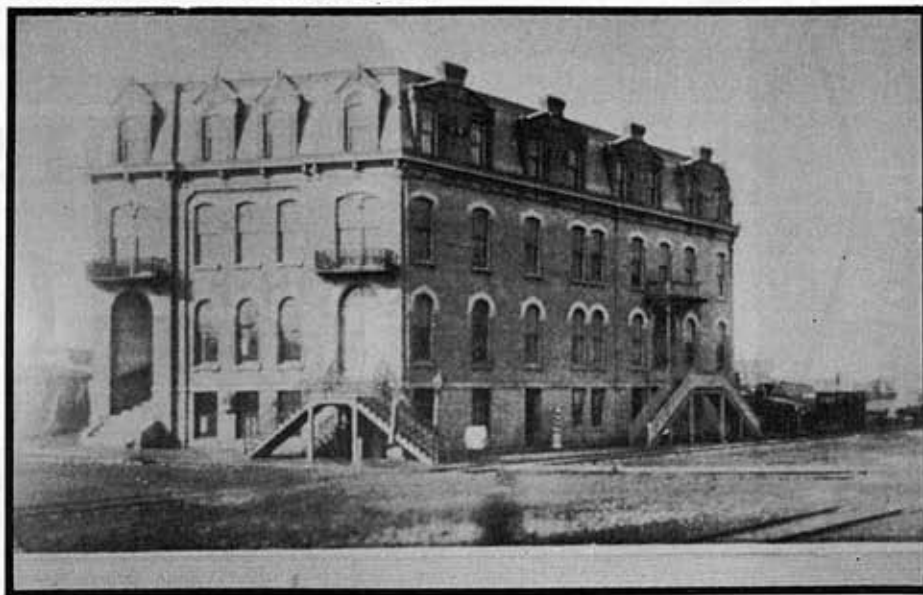
The Crandall House next to the old Rolla Depot was also known as the Imperial, El Caney and Baltimore.