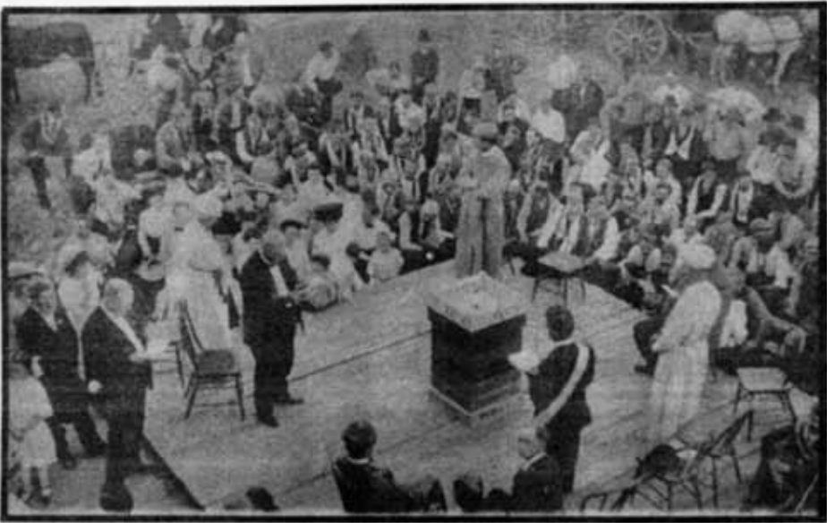
Dedication of the Dixon Oddfellow's Hall in 1910.