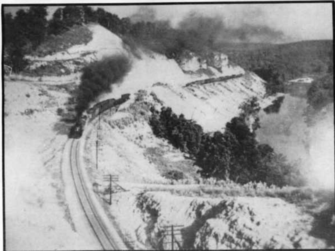
4500 CLASS 4-8-4 lifting a 48 car westbound up the new Dixon hill grade above the Gasconade.