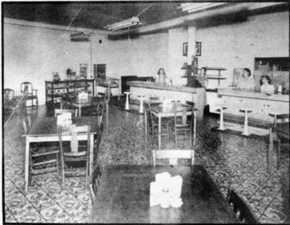
Cain's Restaurant, Dixon, Mo.