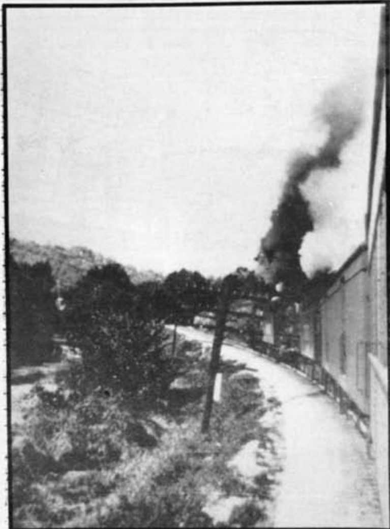
All is serene along the shaded banks of the Gasconade River, but thunder and smoke prevail on the adjacent Frisco right-of-way as engine No. 4145 and road engine No. 1507 swing first to the left then to the right as they battle the ascending grade of Dixon Hill near Arlington, Missouri, with the westbound Bluebonnet in 1946.