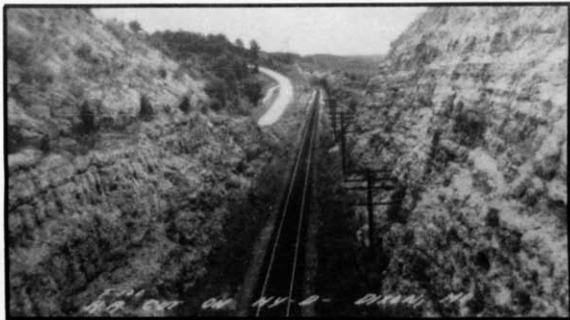
Railroad cut on Highway D.