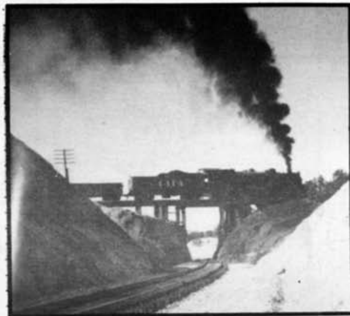
Last freight train up the old grade crosses over the new line on temporary trestle work behind 4-8-2 No. 4414. No. 1508 is pushing at the rear. Shortly after, it was dismantled and the new trackage beneath it was put into use.