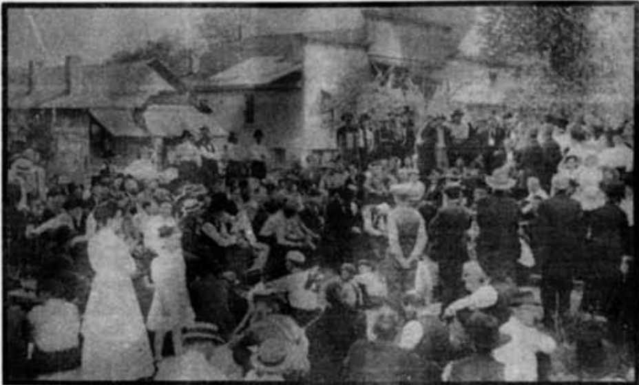
Dedication of the Dixon Oddfellow's Hall in 1910.