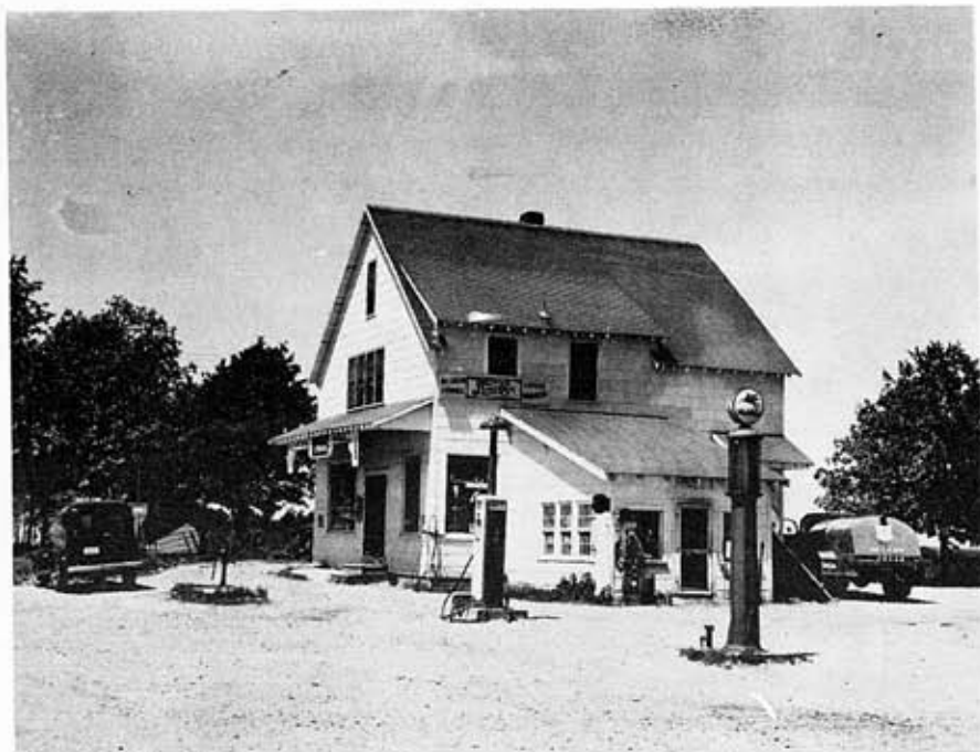
D&D Cafe and Market in Buckhorn.