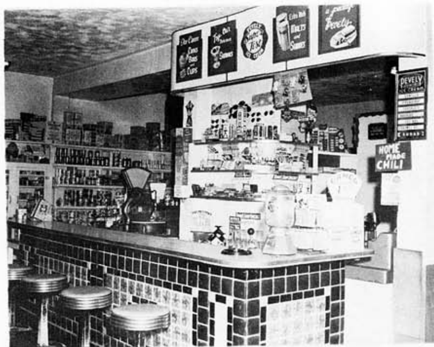
Memories of yesterday at the D&D Cafe and Soda Fountain.