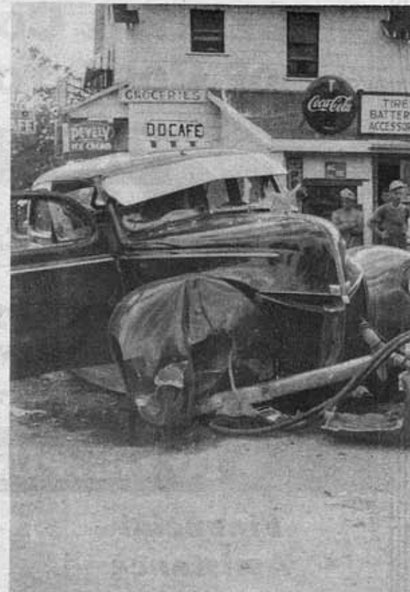
This car took out the gas pump at the D&D Cafe and Market in Buckhorn.