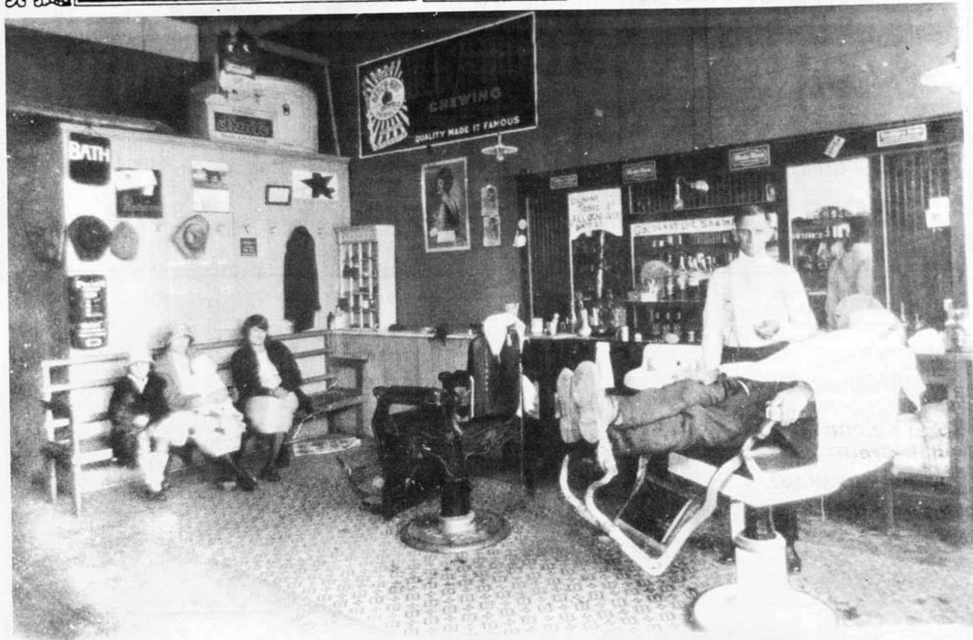
SHAVE AND A HAIR CUT AT DIXON'S BARBER SHOP