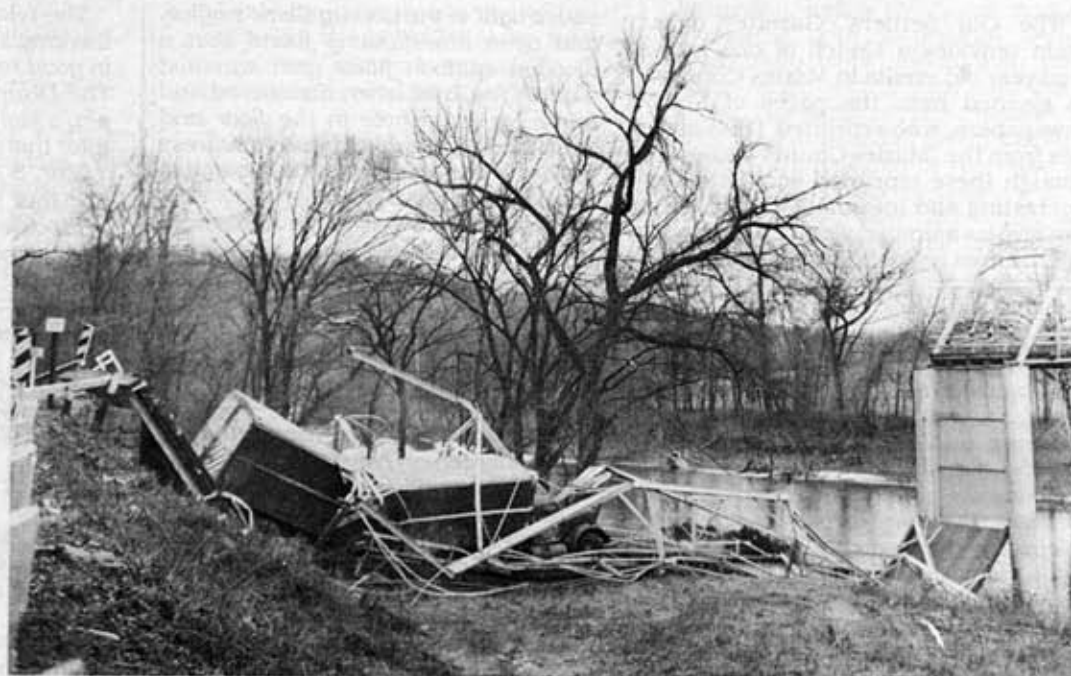
Highway 7 Bridge Collapse