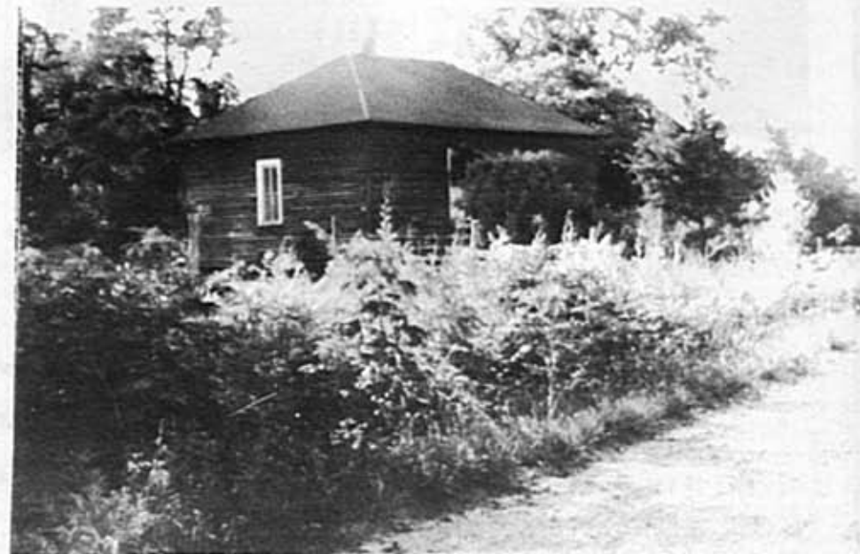
Old Spring Creek Post Office