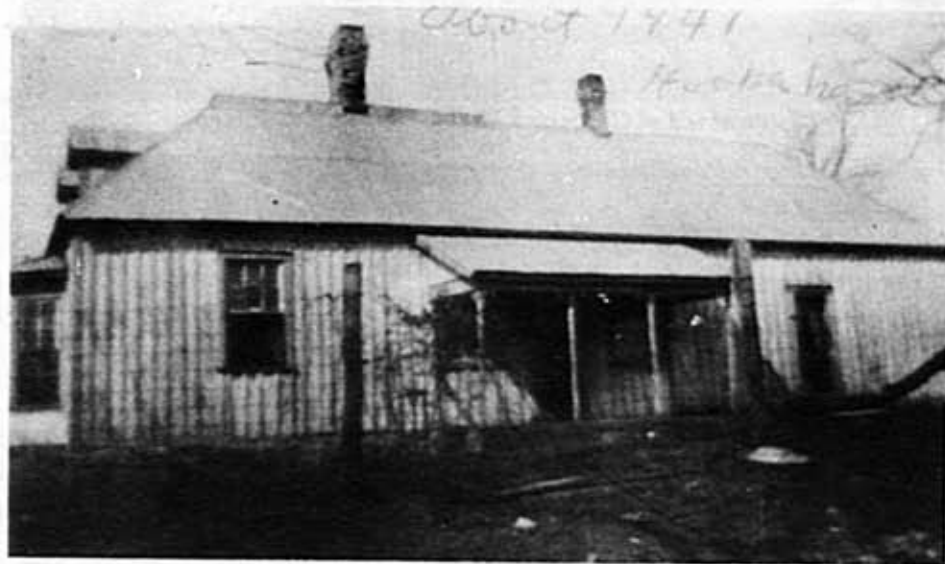
The old Hooker house in the late 40's owned by Bill Prewett and later Birdie Russell.