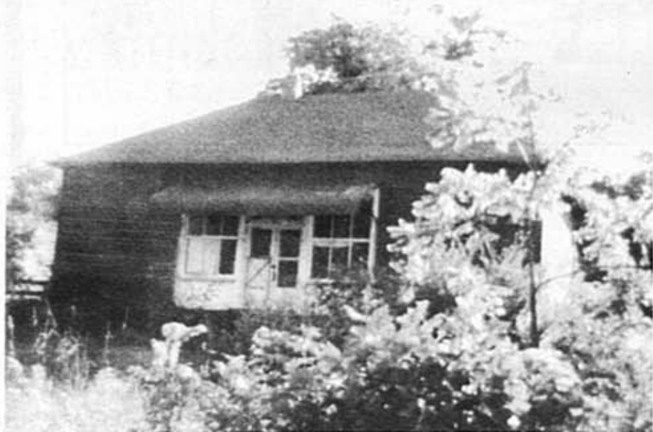
Old Spring Creek Post Office