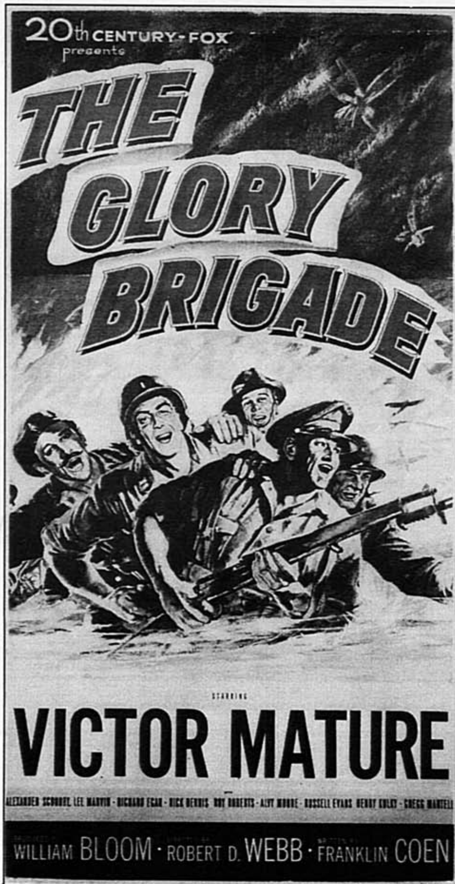
The movie poster advertising "The Glory Brigade." "THE GLORY BRIGADE" 1953, 20th Century Fox Film Corporation, used by permission.