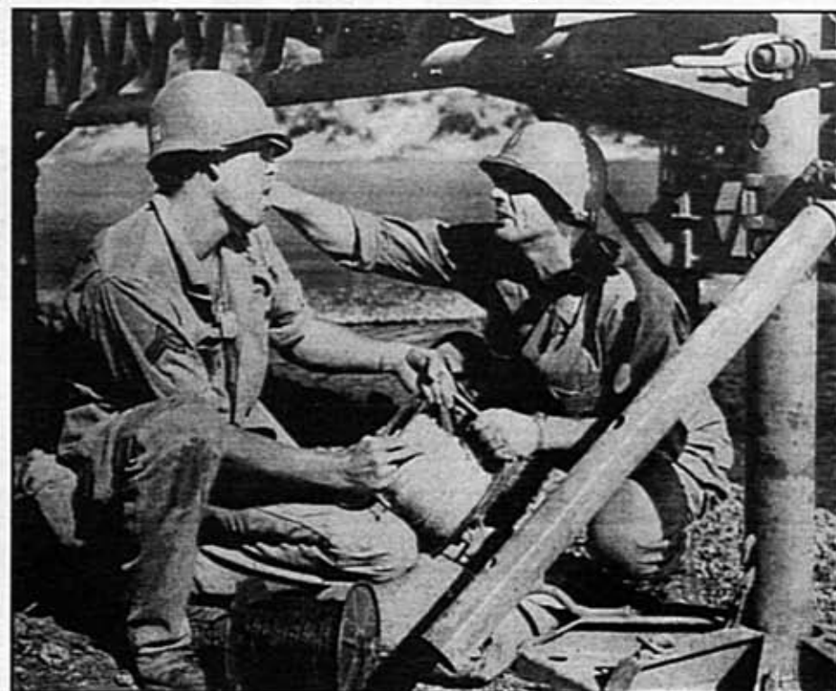
Lee Marvin and Victor Mature in a scene under the bridge built by Fort Leonard Wood Engineers. "THE GLORY BRIGADE"