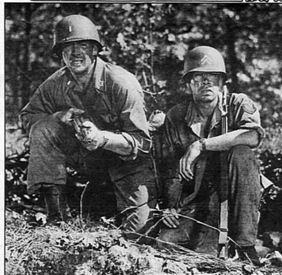
Actors Victor Mature and Lee Marvin get ready for battle.