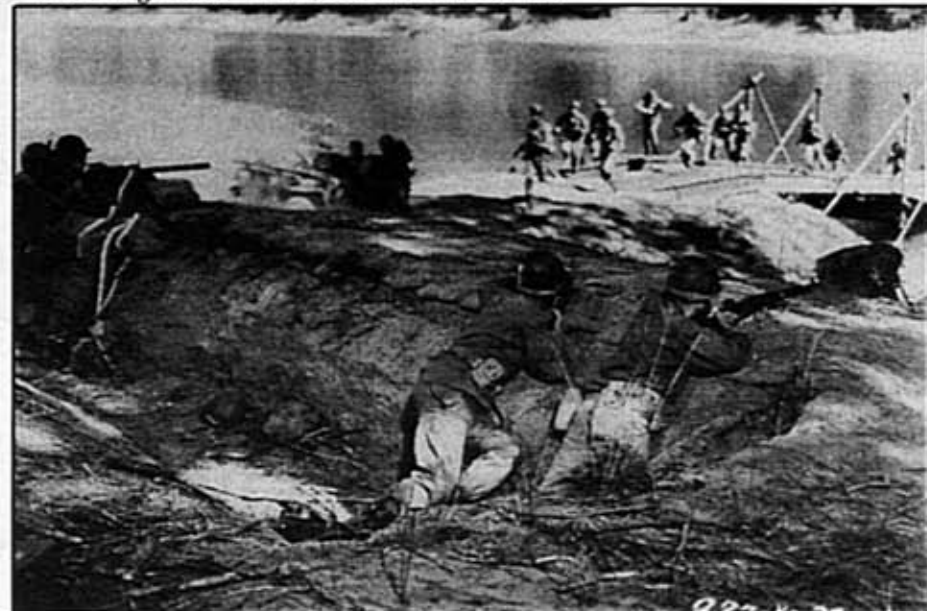
Battle scene with explosions in the Big Piney.