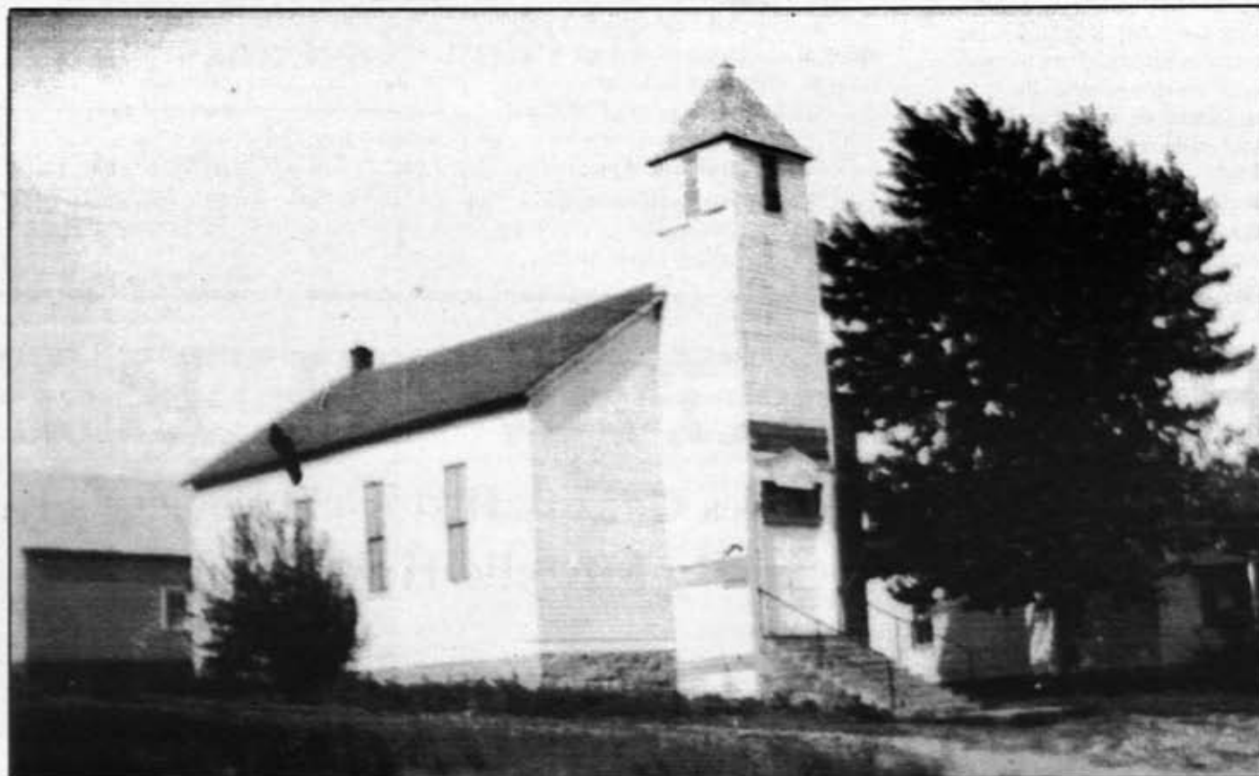
VIENNA METHODIST Church in 1937.

Church members are planning to publish a pictorial/history book of past and present church families and events not only of the Methodist church in Vienna, but also other