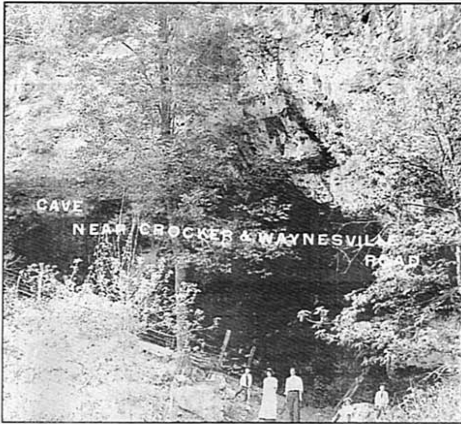
OLDTIME visitors to Indian Cave.