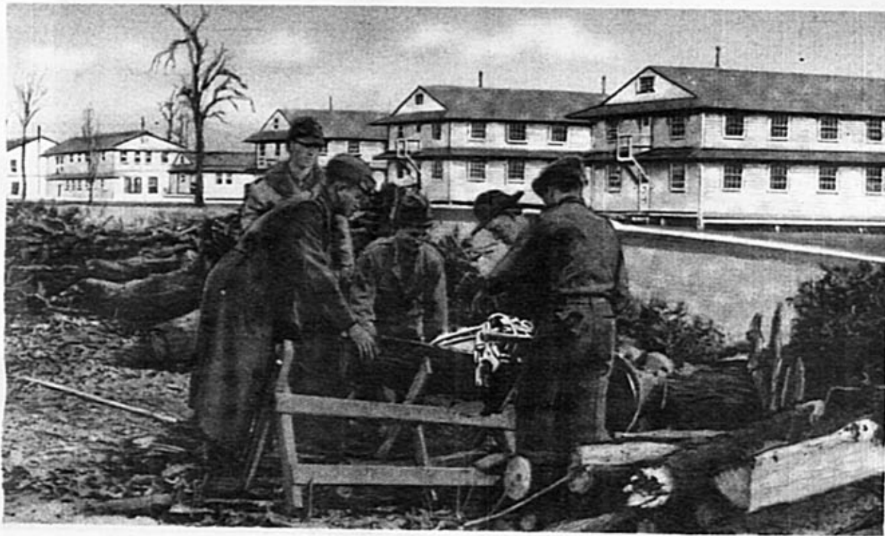
CUTTING WOOD AT FORT LEONARD WOOD.